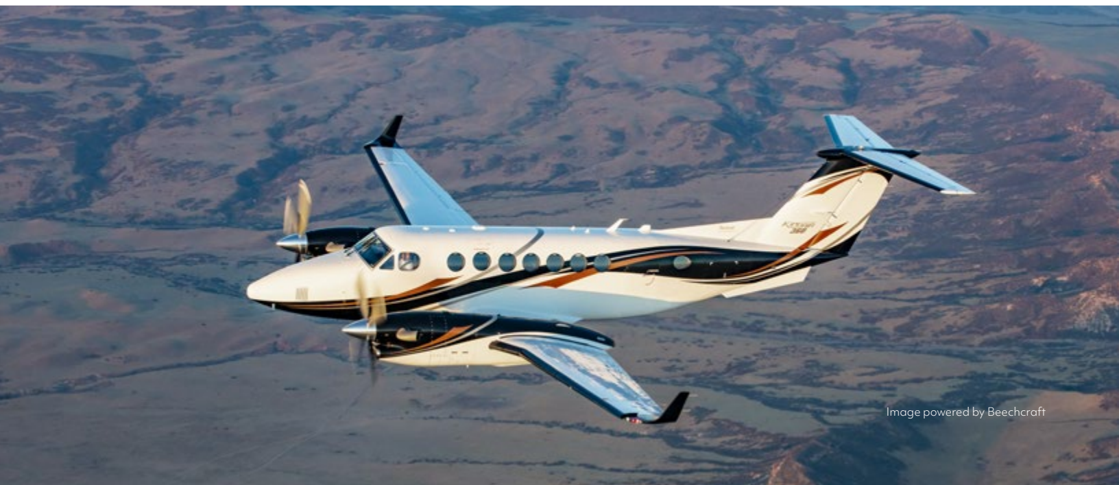
Image powered by Beechcraft