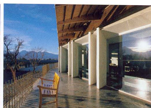
Main picture, the salt flats of Salar de Uyuni in Bolivia. Above, from left: the Bolivian town of Potosi; llamas; Hotel de Larache in the Atacama Desert