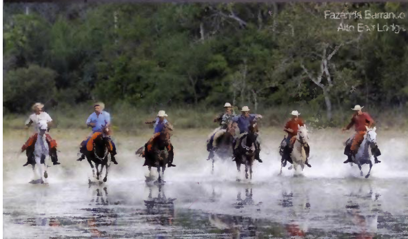
Fazenda Barranco Alto Eco Lodge

Torres del Paine National Park, Chile. Tel: +56 2206 6060; explora.com