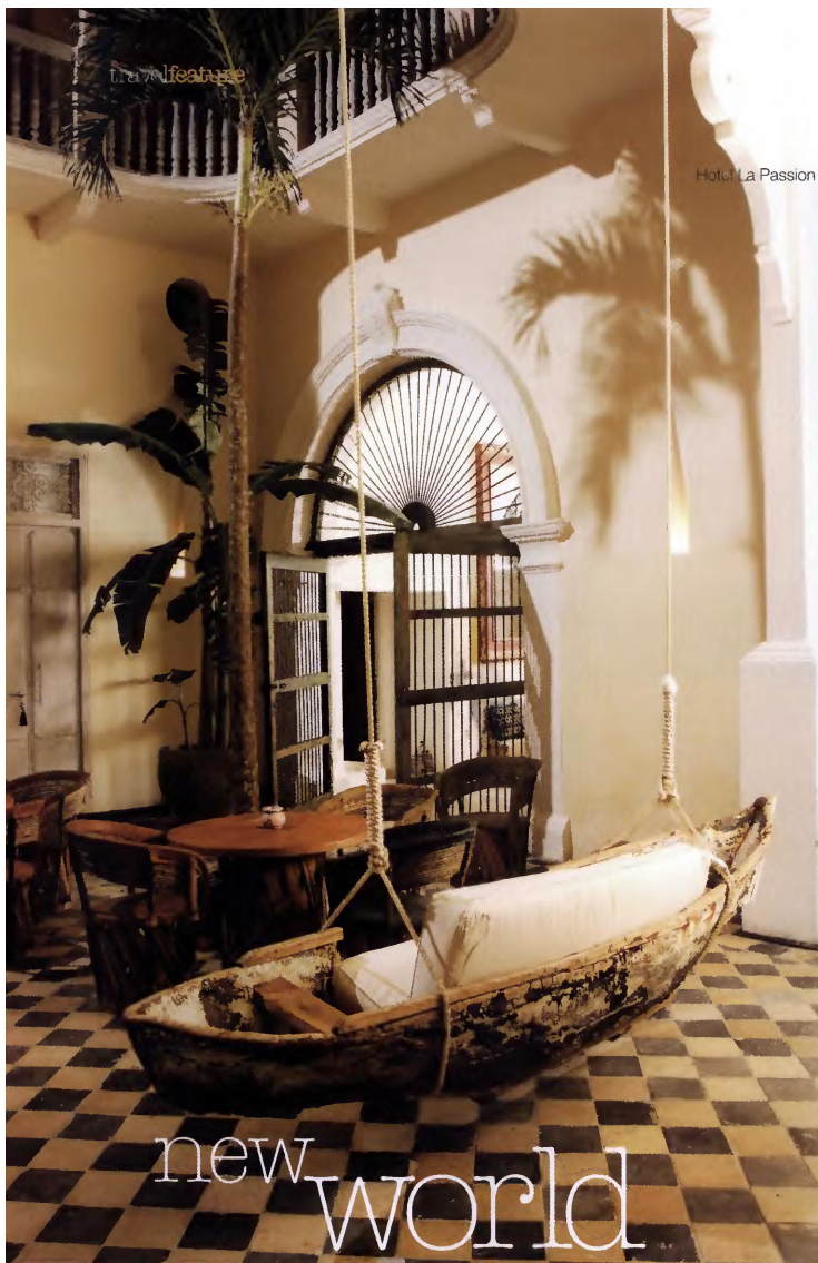
Hotel La Passion