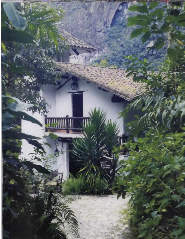
El Pedral Lodge

Southern Pantanal, Brazil. Tel: +55 679 654 3383; fazendabarrancoalto.com.br