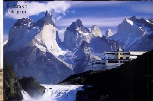
Explora en Patagonia