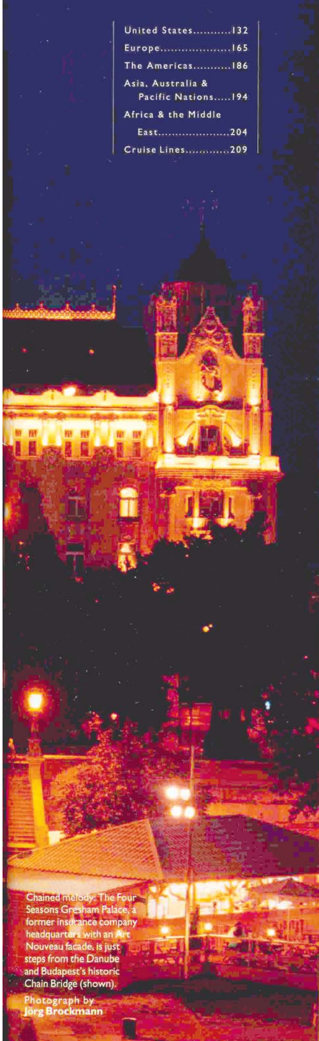
Chained melody: The Four Seasons Gresham Palace, a former insurance company headquarters with an Art Nouveau facade, is just steps from the Danube and Budapest's historic Chain Bridge (shown).